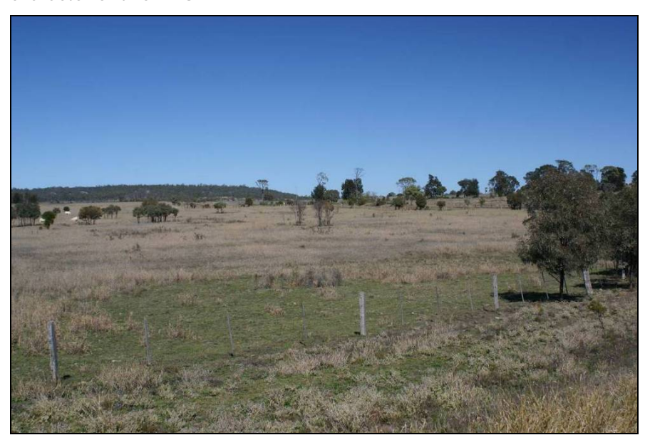
Figure 19-9: This VMU is dominated by live-stock grazing lands with scattered low tree cover

Topography in this VMU is gently undulating from approximate elevations of 320 m to 360 m. This section of the proposed pipeline alignment differs from the above units in that it is cropping and live-stock grazing lands with scattered tree cover (refer Figure 19-9). Homestead buildings, including residences and sheds are features of the landscape character of this VMU.