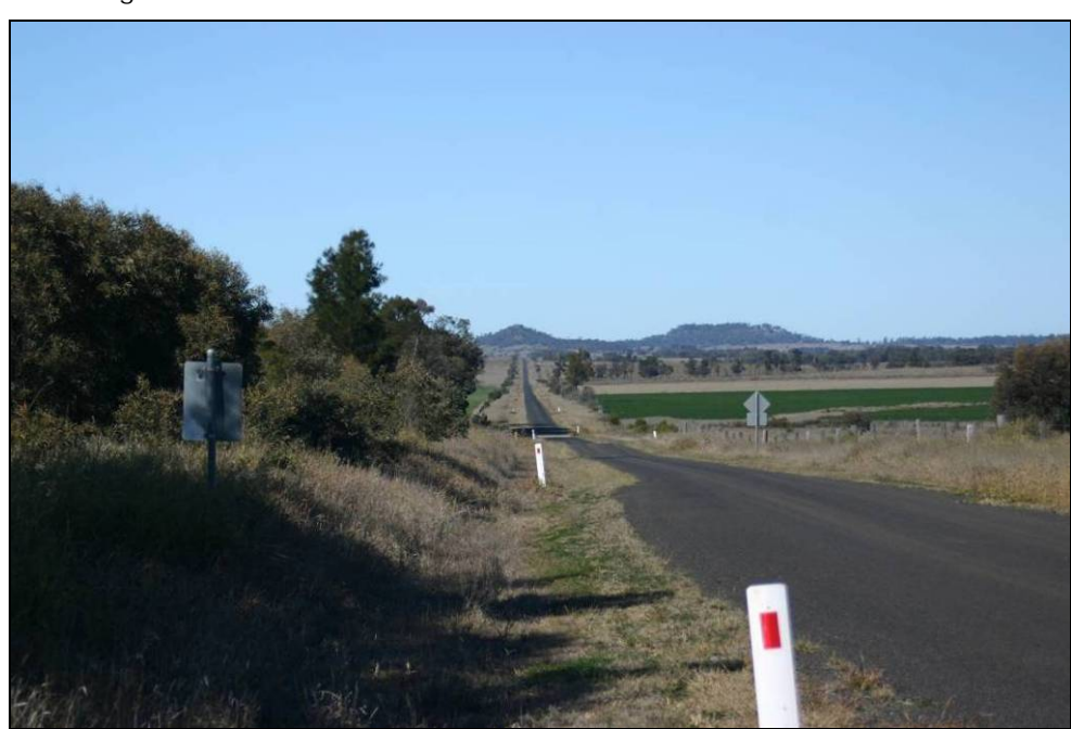
Figure 19-10: Linear strips of roadside vegetation are frequent along Peakes Road

The alignment across the MLA area has not yet been determined and will be dependent on mining infrastructure. The alignment, although not fixed, will cross open grassland and grazing land with scattered low tree cover (refer Figure 19-11). The topography is typically level at an elevation of approximately 280 m. Some linear vegetation is evident along the road verges.