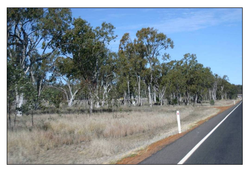
Figure 19-6: Scattered vegetation and open grassland along the eastern edge of the highway road reserve