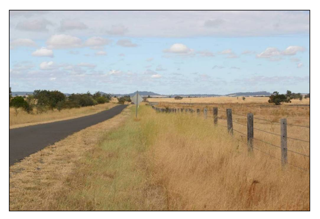
Figure 19-11: This VMU is dominated by open grassland and live-stock grazing land with roadside vegetation in some locations