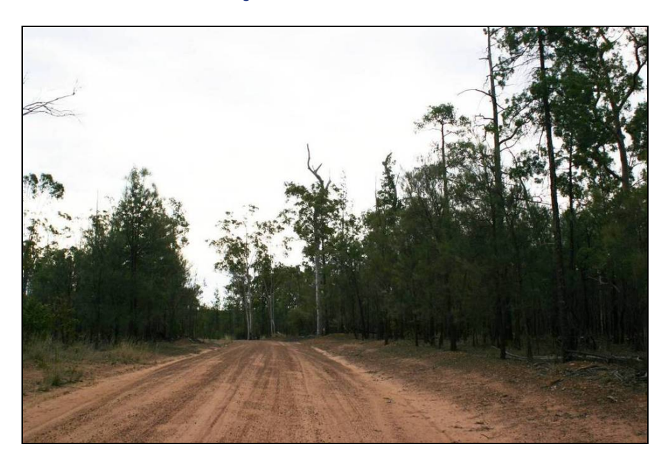
Figure 19-8: Road verges are dominated by Cypress and Eucalypt tree cover Open field section VMU

North of Giligulgul, the proposed pipeline alignment turns north-west and traverses Lot 28 CP885313, Lot 44 FT988, Lot 36 FT213, Lot 4 FT526 and Lot 39 FT1000 prior to meeting with Fosters Road.