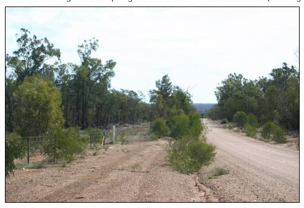
Figure 19-4: The proposed pipeline travels in an east – west direction along the existing transmission line easement

The vegetation buffer on the eastern edge of the highway is more dispersed throughout this VMU allowing views to open grassland areas with scattered trees (refer Figure 19-6).