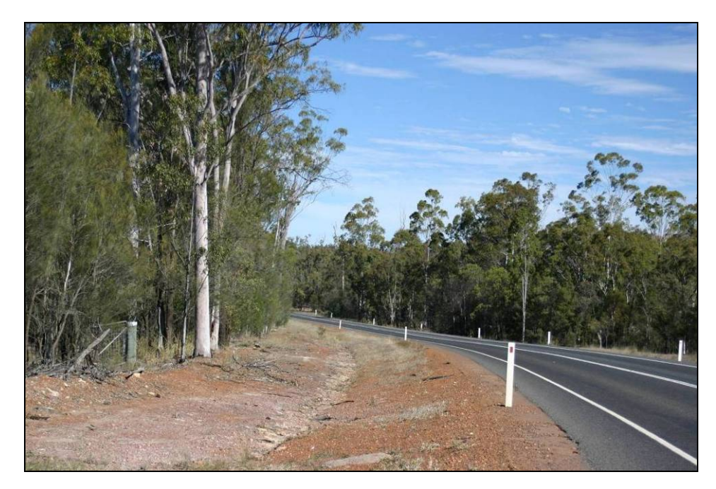
Figure 19-7: Some areas of the highway have dense roadside vegetation screening views beyond the highway road reserve