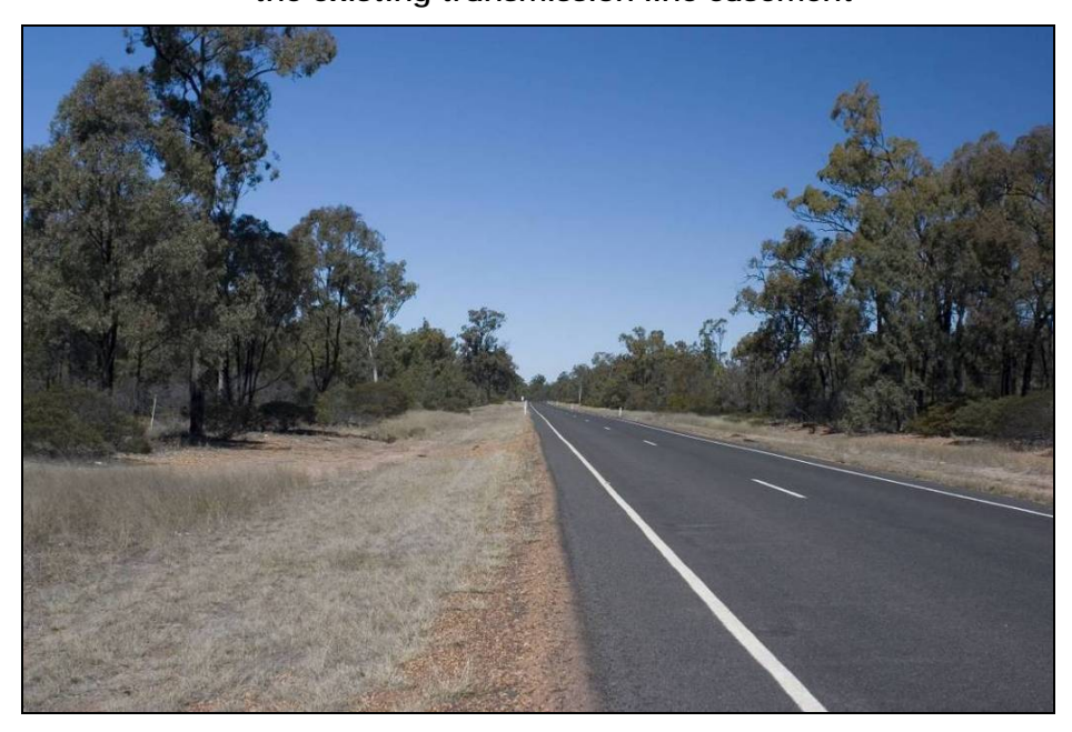
Figure 19-5: Tall woodland vegetation in the Leichhardt Highway road reserve