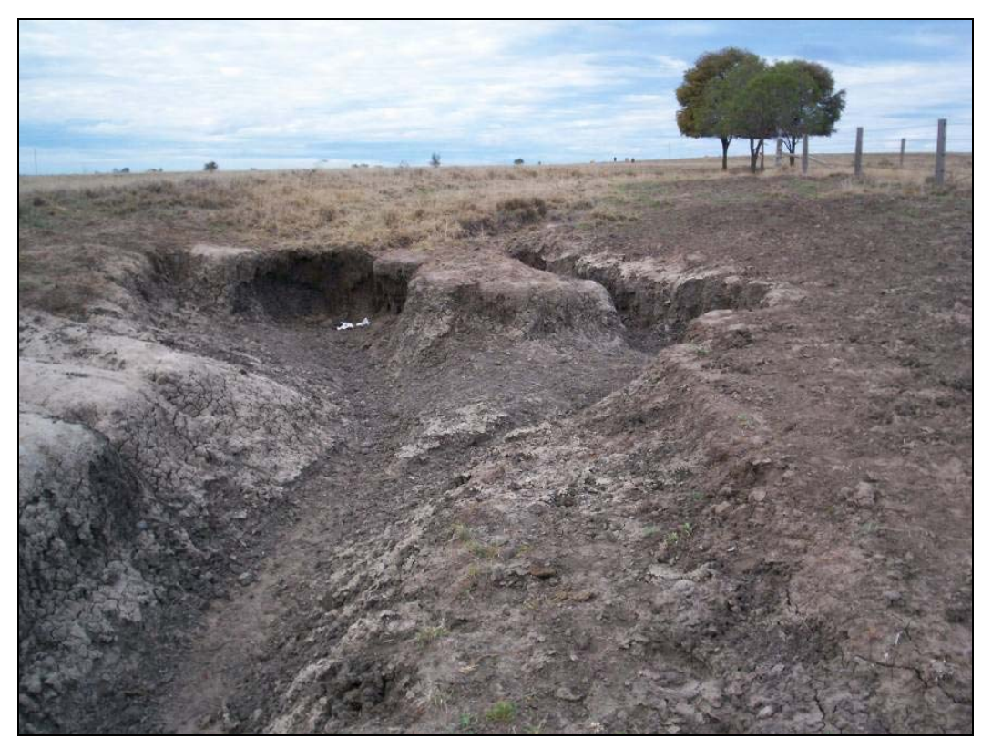
Photo 9-1: Gullyhead erosion caused by exposure of dispersive soils in a drainage line on a gentle slope near WS26