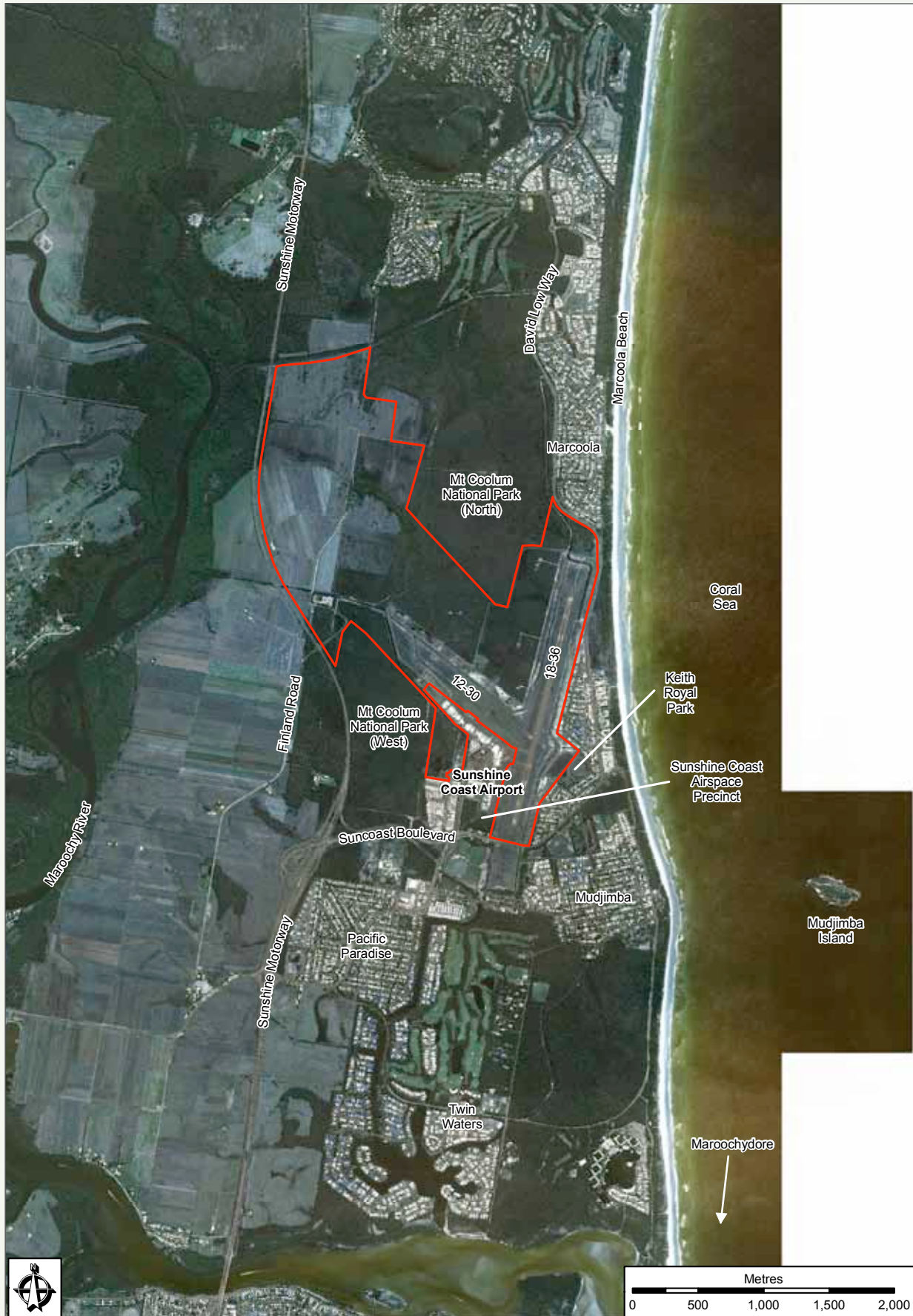
Figure 1.1a: Sunshine Coast Airport and surrounds. The airport boundary is defined by a red keyline.