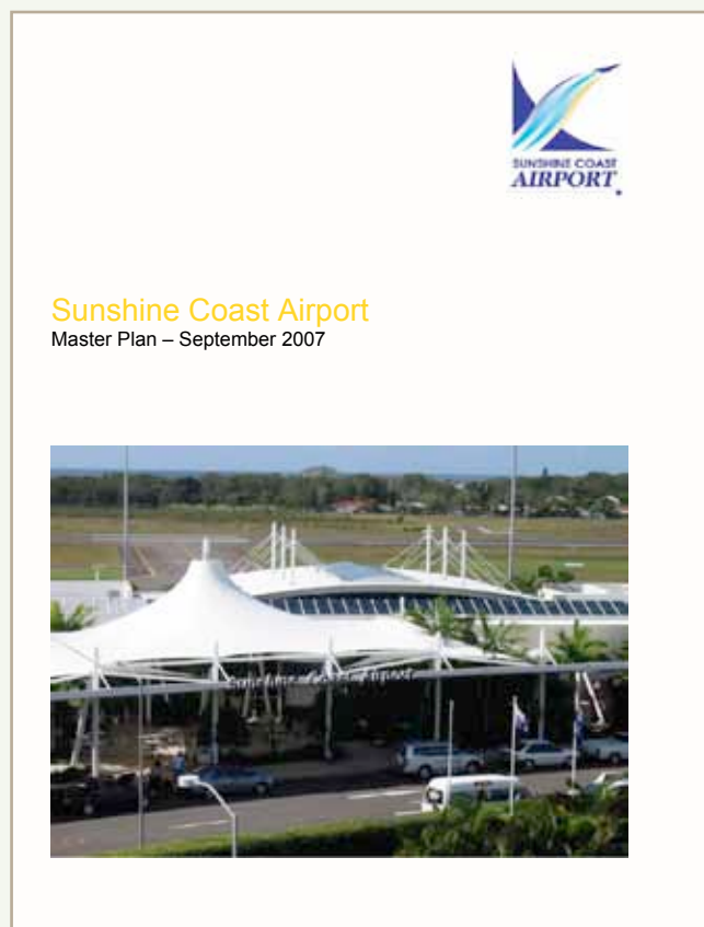
Figure 1.1b: Sunshine Coast Airport Master Plan

The subsequent final Master Plan 2007 addressed the feedback received during the public consultation process, council's review of that plan, and sets the direction of development for SCA until 2020.