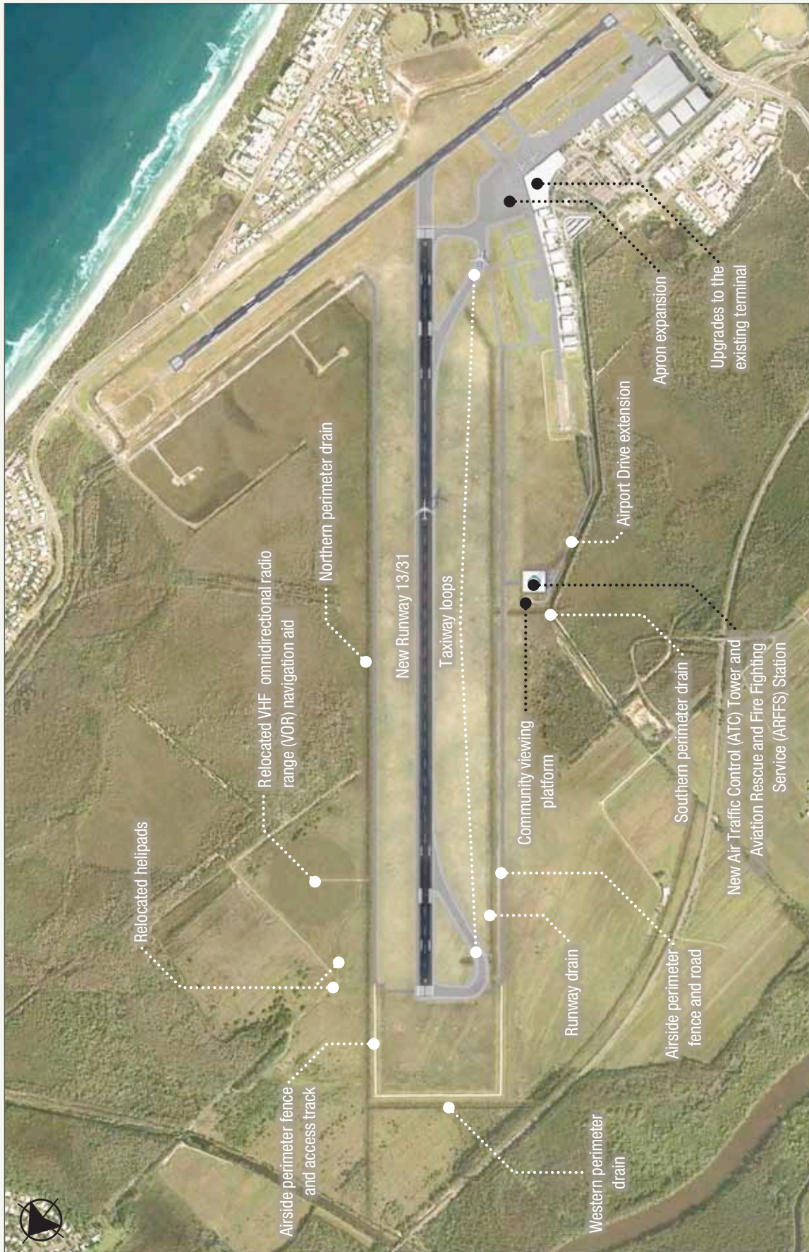
Figure 1.4a: Proposed development