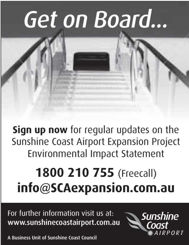
Example of newspaper advertising July 2012