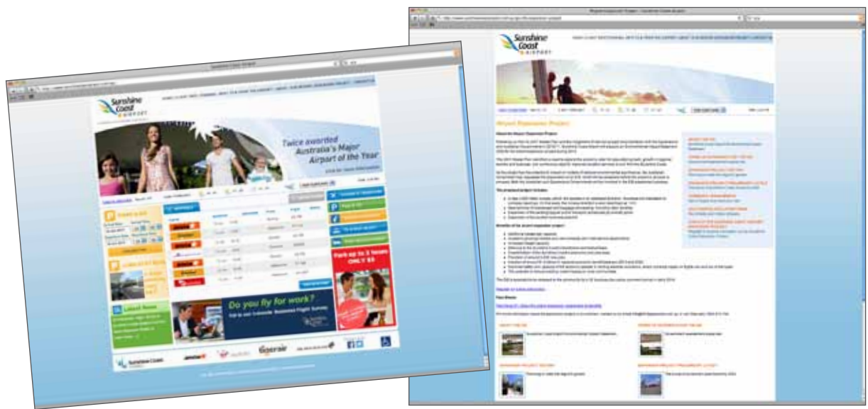
Expansion Project website pages explained the history and technical information about the Project