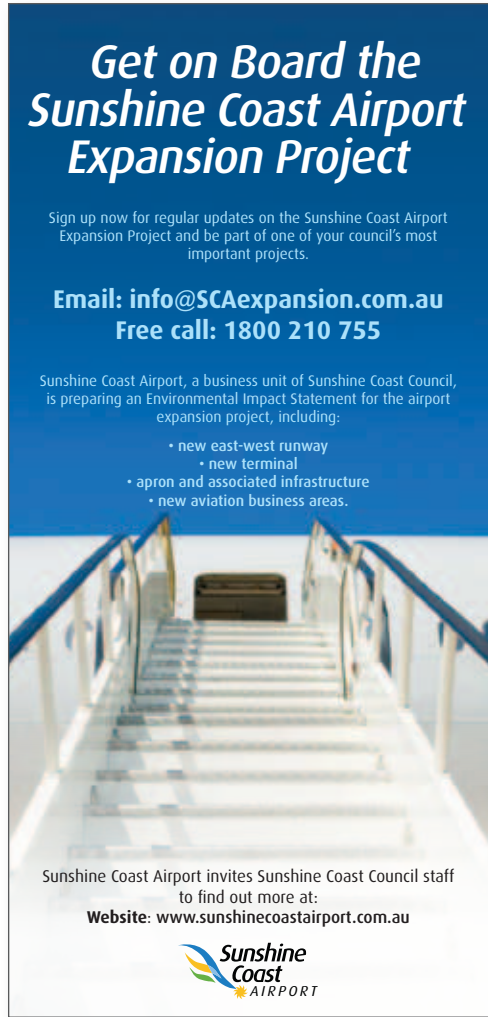
Project flyer distributed to SCC's 'field staff'