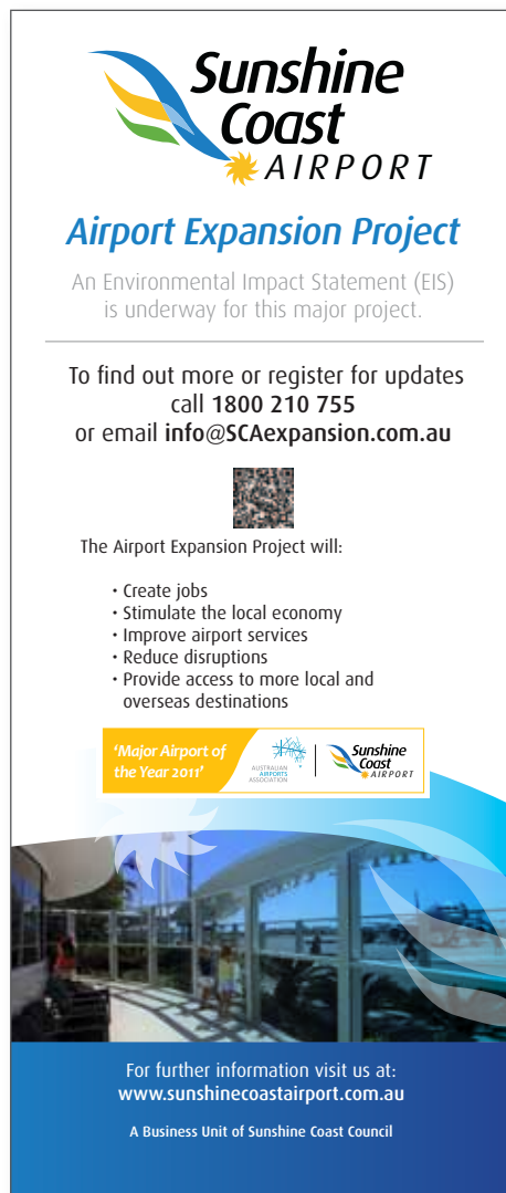
Pull up banners were used at the airport and at SCA and SCC events to promote EIS Community Liaison Officers' contact details