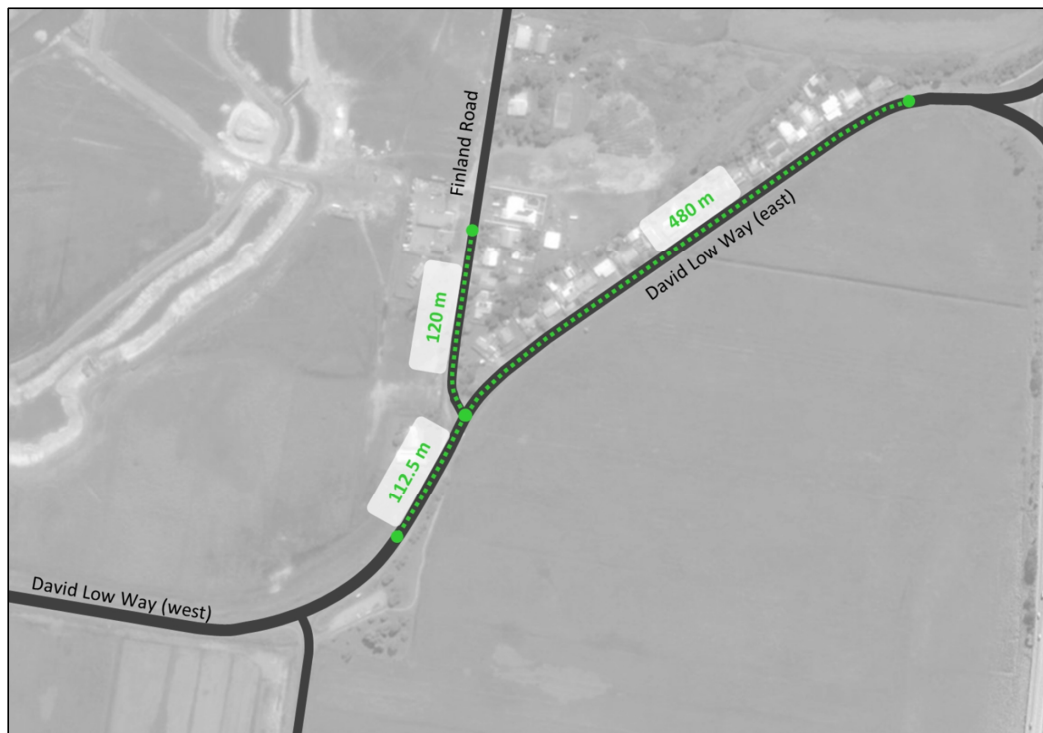
Figure 2 Measured sight distances