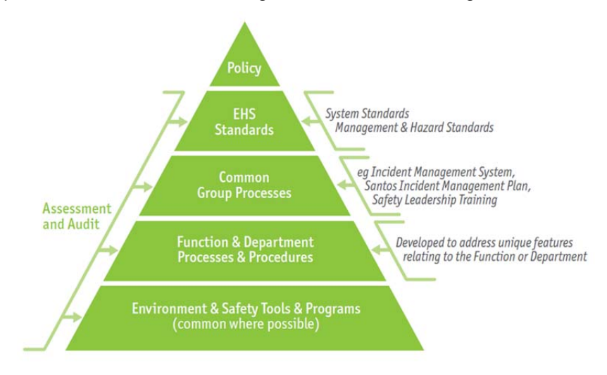
Figure 2: Santos Approach to Environmental Management

The Santos approach to environmental management is illustrated in Figure 2.