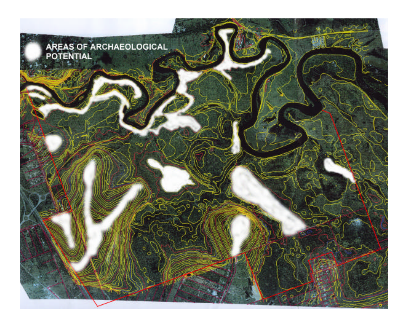
Map 4. Location of Areas of Archaeological Potential