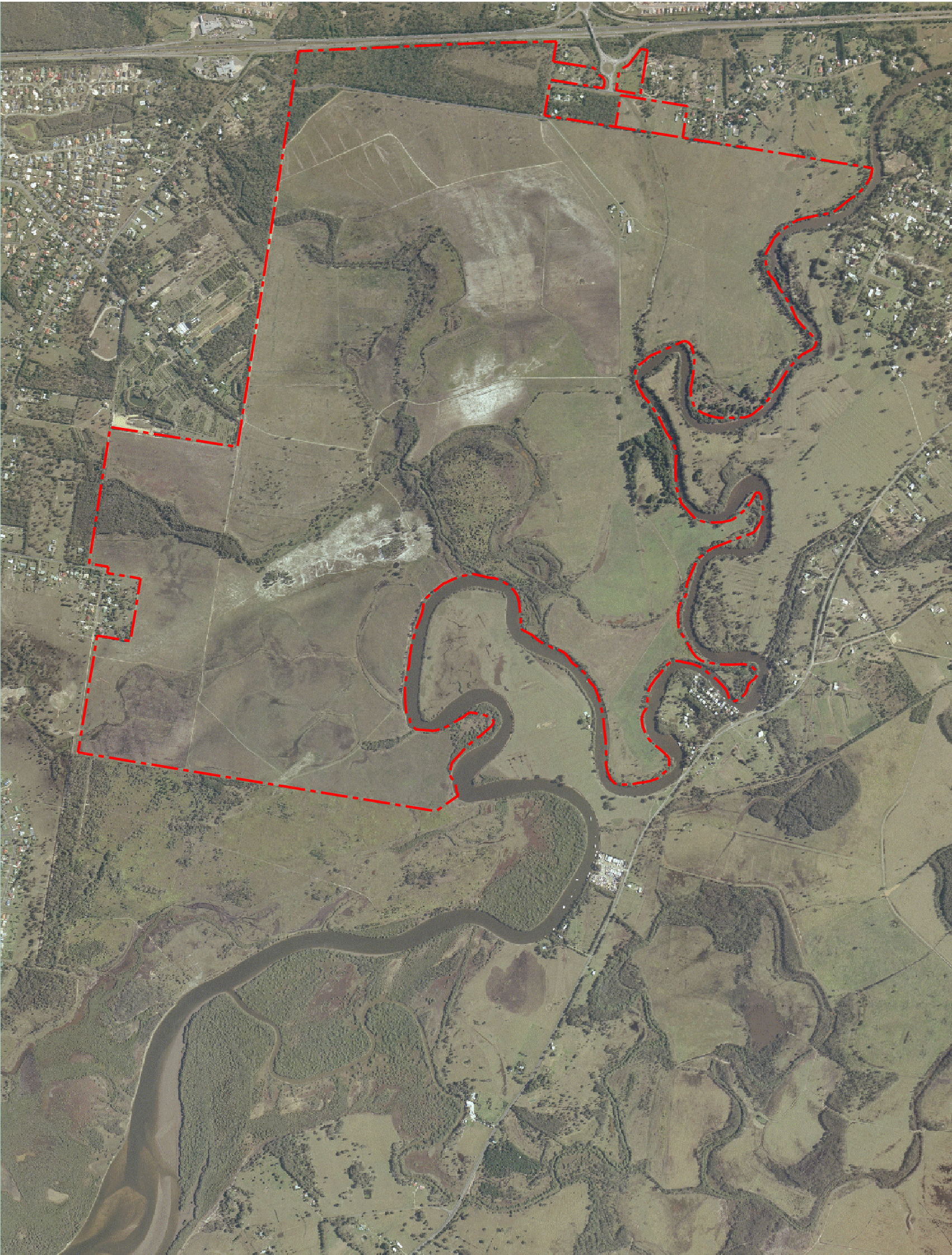
Date of Aerial Photograph - July 2007

© Cardno (Oid) Pty Ltd All Rights Reserved 2007. Copyright in the whole and every part of this drawing belongs to Cardno (Oid) Pty Ltd and may not be used, sold, transferred, copied or reproduced in whole or in part in any manner or form or on any media, to any person other than by agreement with Cardno (Oid) Pty Ltd. This document is produced by Cardno (Oid) Pty Ltd solely for the benefit of and use by the client in accordance with the terms of the retainer. Cardno (Oid) Pty Ltd does not and shall not assume any responsibility or liability whatsoever to any third party arising out of any use or reliance by third party on the content of this document.