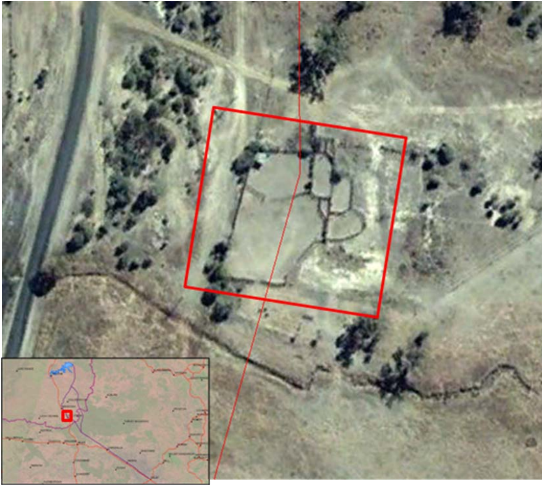
Figure 8B-4 Stockyard 10 / Potential Cattle Dip Site (Google Earth Pro 2010)