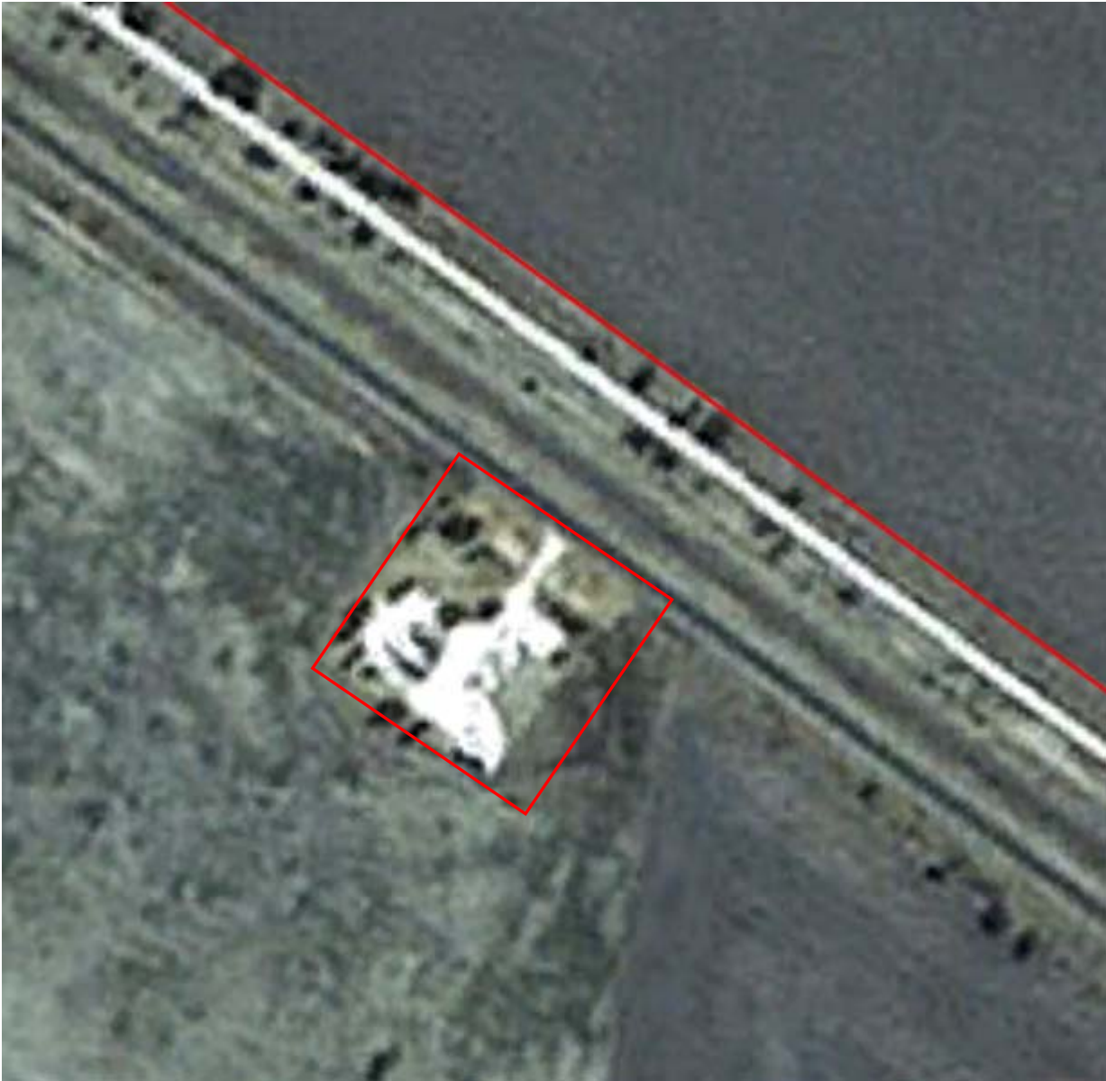
Figure 8B-919 Site 8, EMR Chemical Storage (Google Earth Pro 2010)