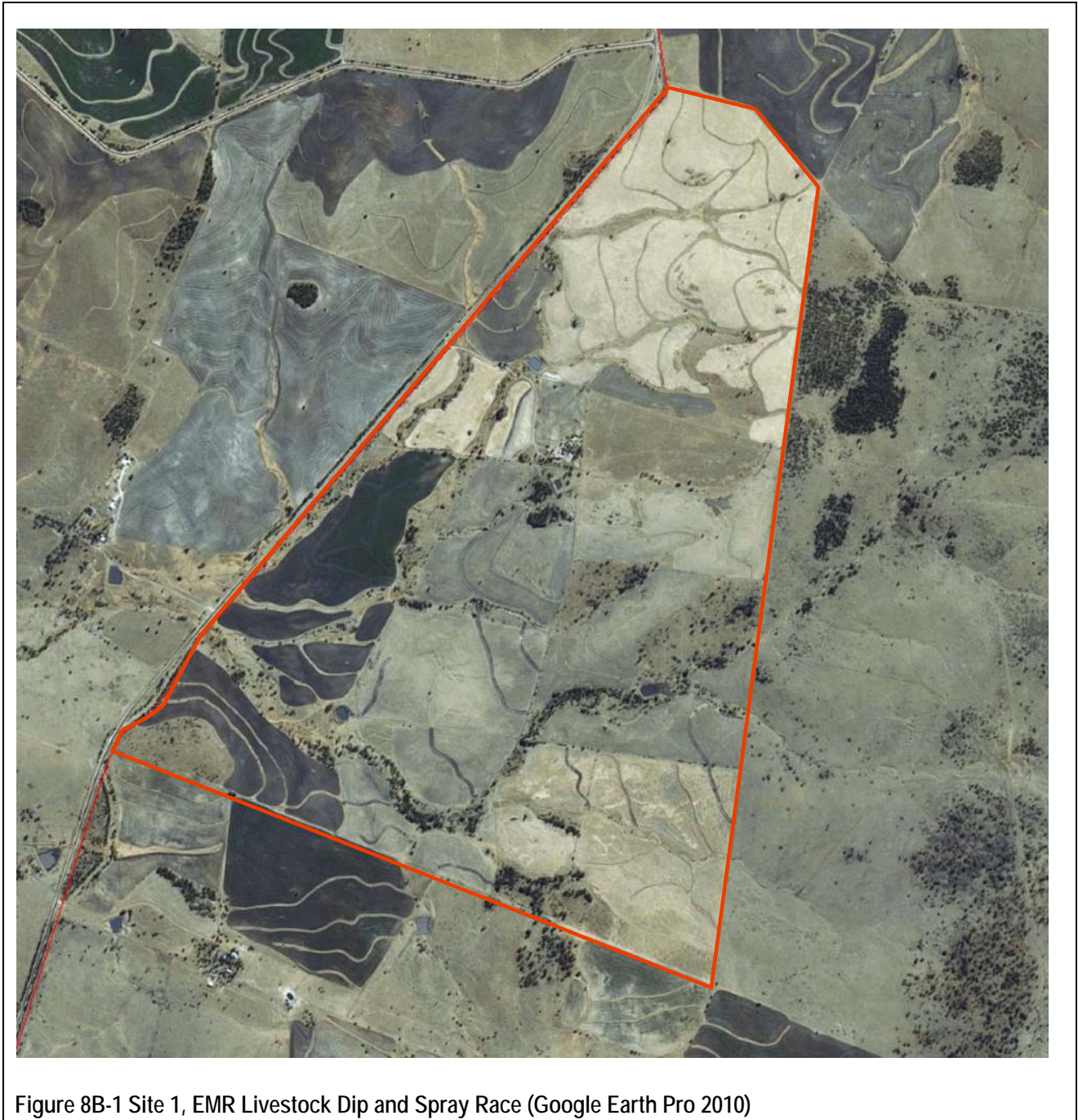
Figure 8B-1 Site 1, EMR Livestock Dip and Spray Race (Google Earth Pro 2010)