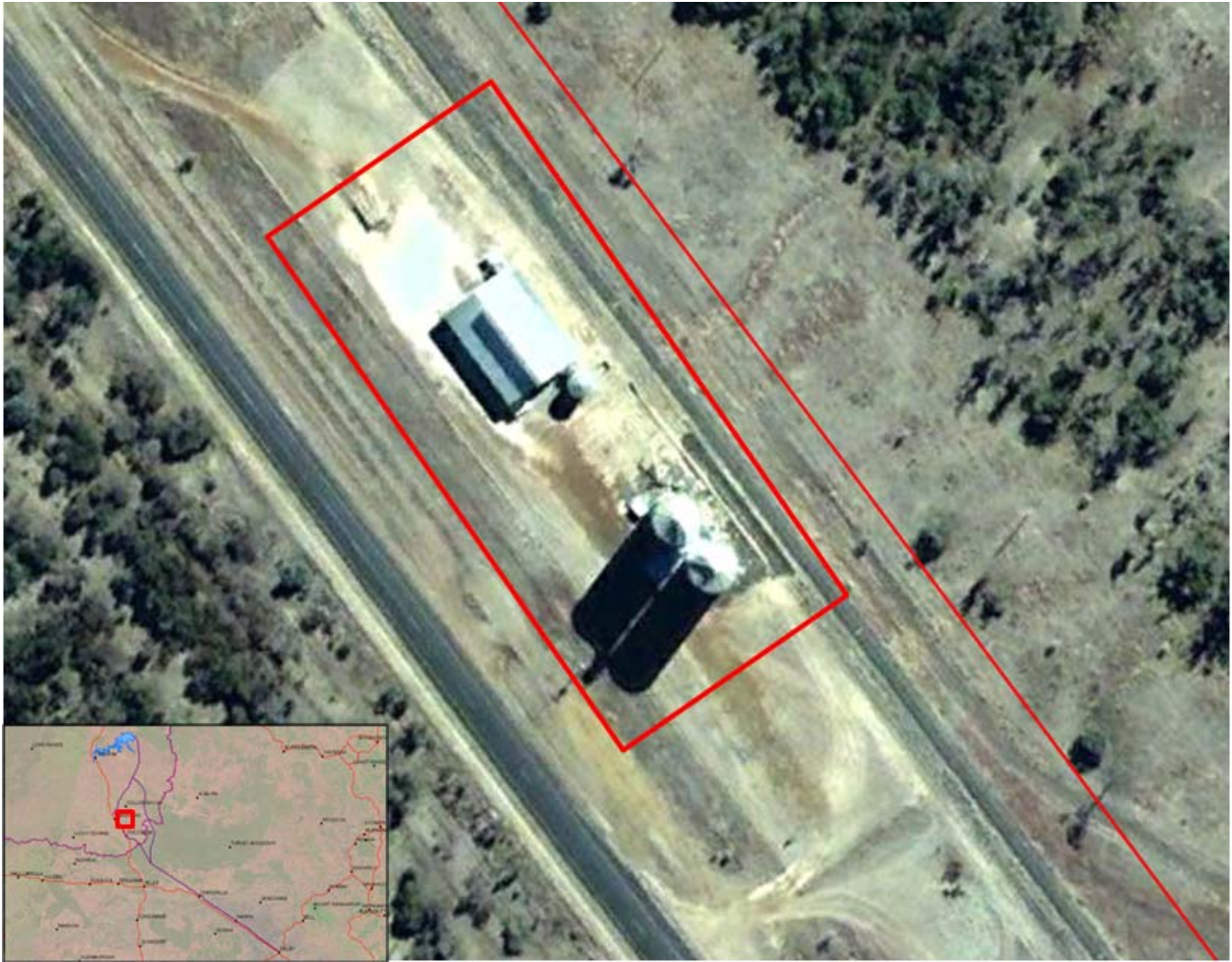
Figure 8B-5 Site 4, EMR Petroleum Product or Oil Storage (Google Earth Pro 2010)