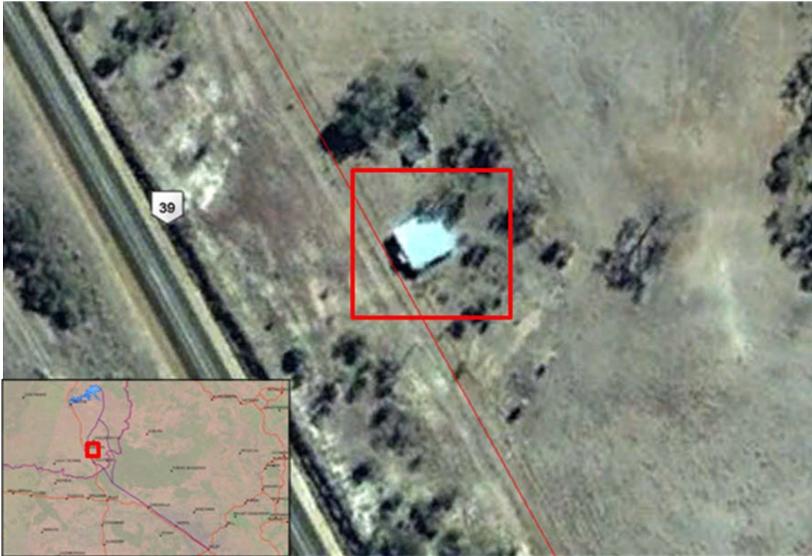
Figure 8B-6 Building 3 (Google Earth Pro 2010)