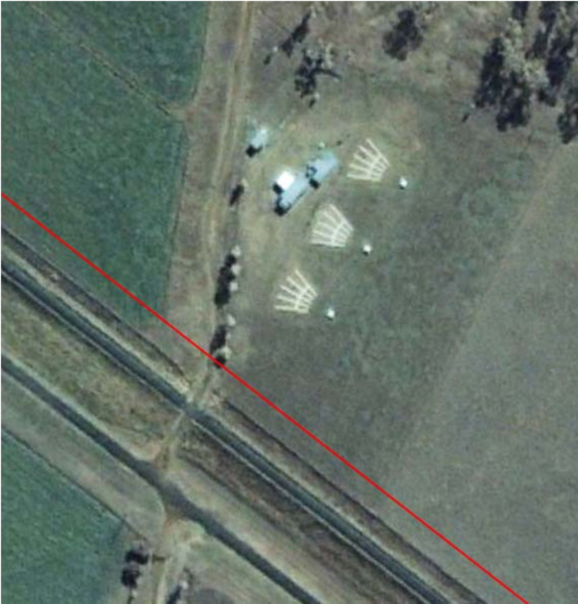
Figure 8B-11 Site 13, EMR Gun; Pistol or Rifle Range (Google Earth Pro 2010)