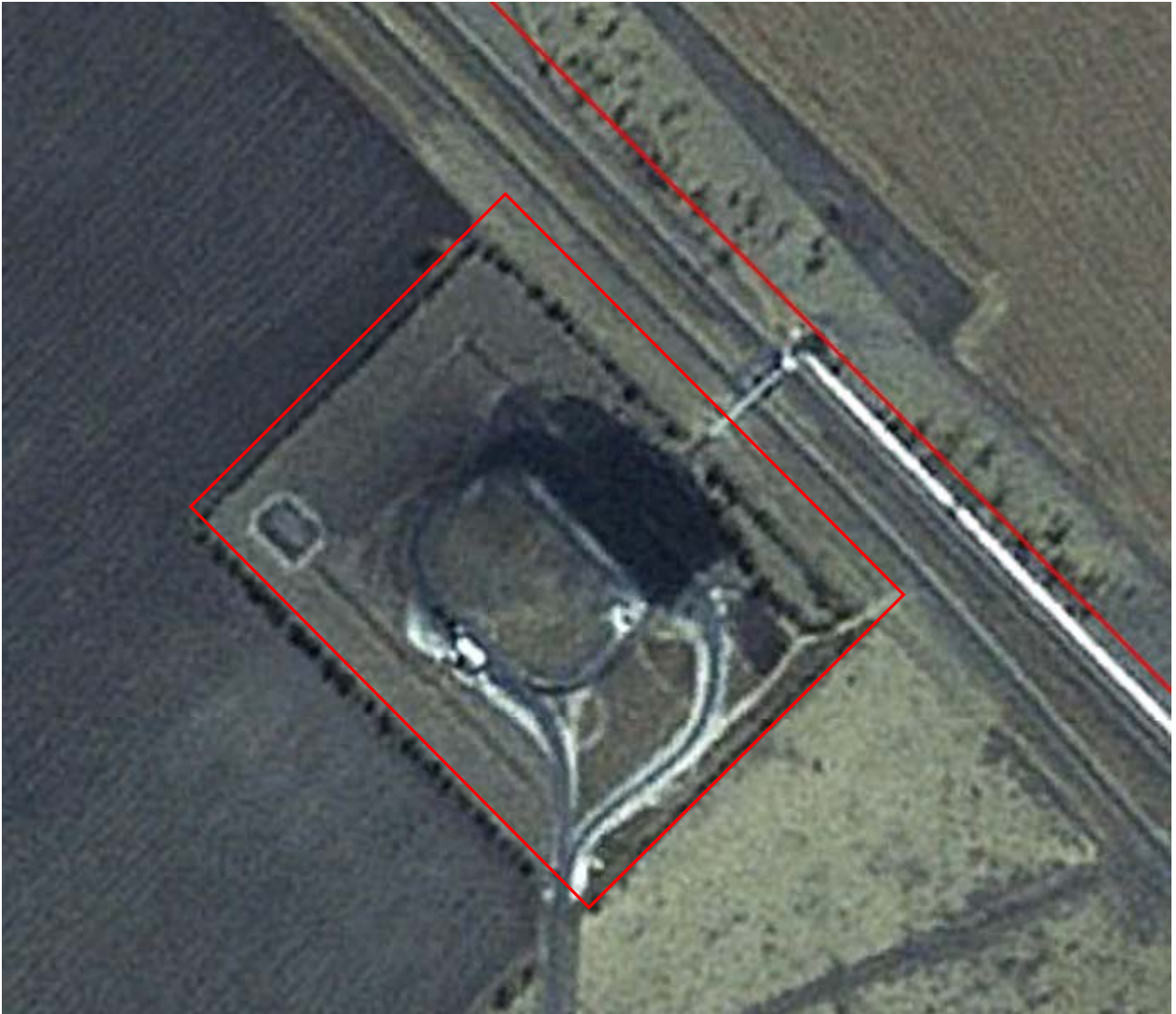
Figure 8B-10 Site 11, EMR Petroleum Product or Oil Storage (Google Earth Pro 2010)