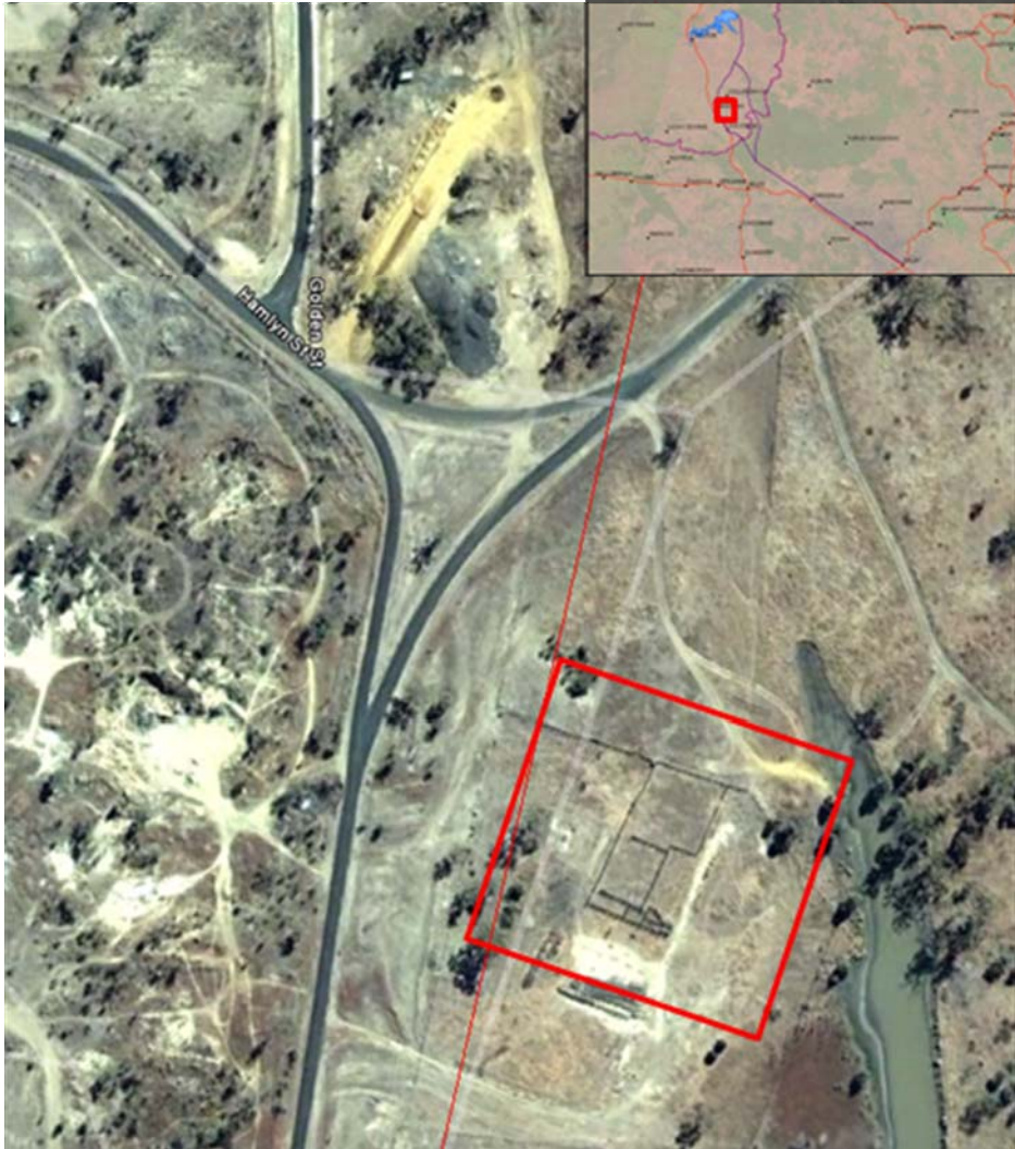
Figure 8B-3 Site 3, EMR Livestock Dip and Spray Race (Google Earth Pro 2010)