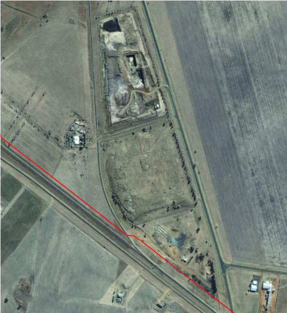
Figure 8B-12 Site 14, Landfill (Google Earth Pro 2010)