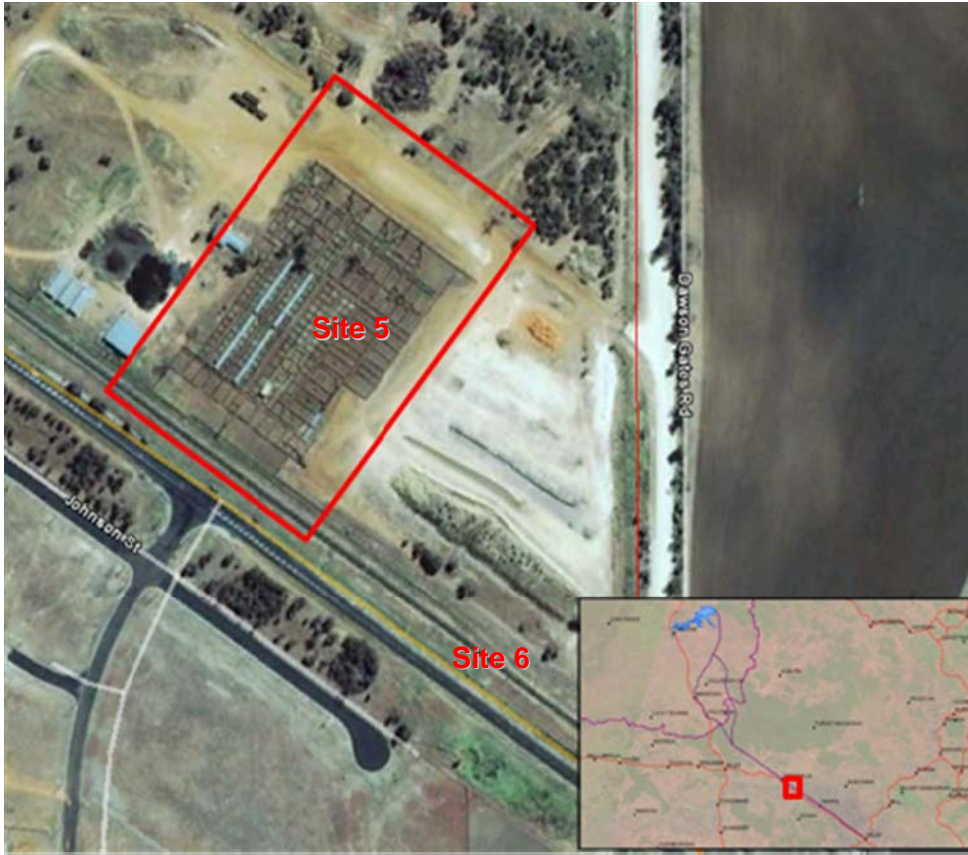
Figure 8B-7 Site 5 & Site 6, EMR Livestock Dip and Spray Race & Site 6, EMR Hazardous Contaminant (Google Earth Pro 2010)