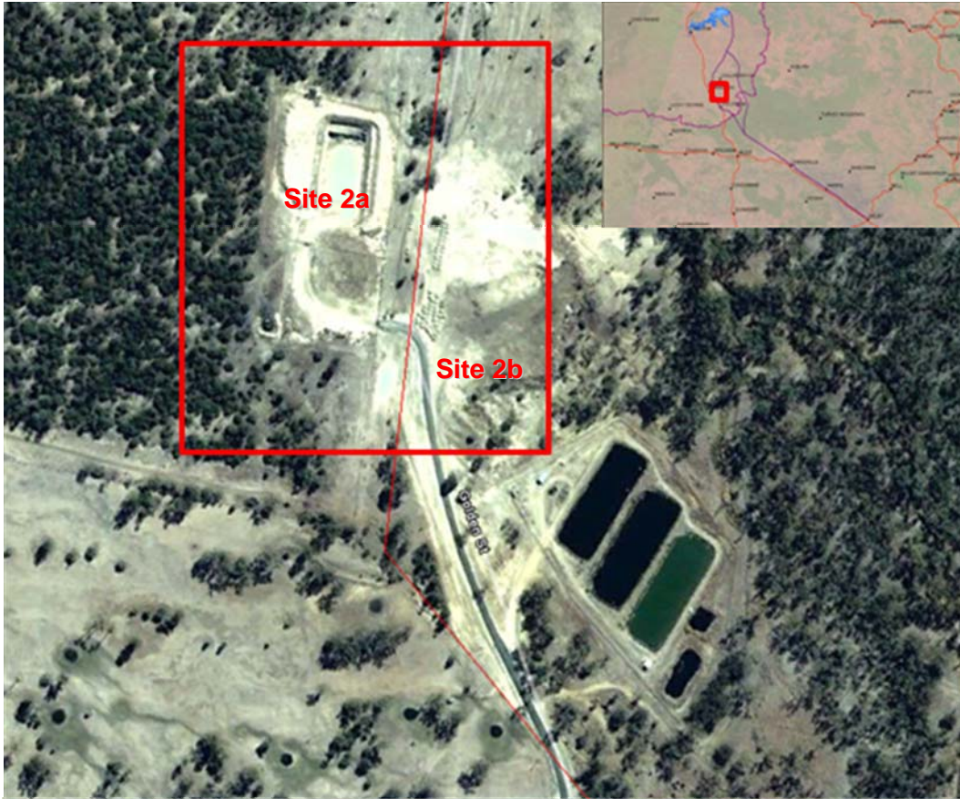
Figure 8B-2 Site 2a/2b, EMR Landfill (Google Earth Pro 2010)