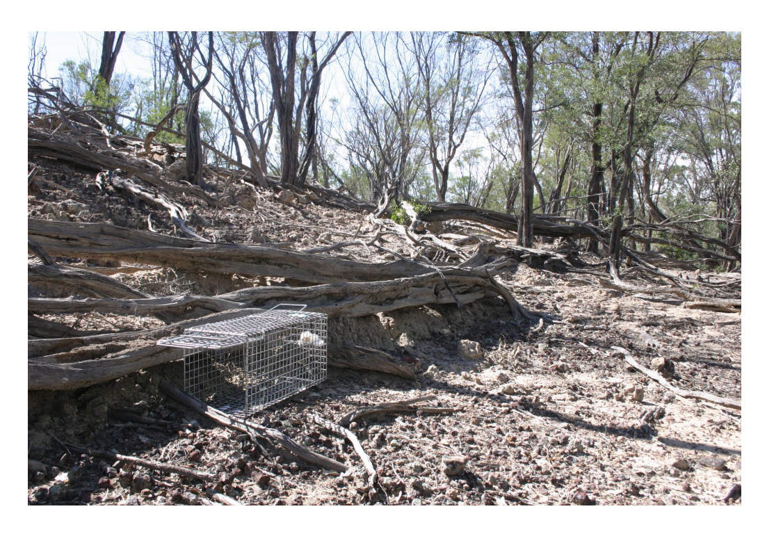
Figure 3: Cage traps were located at the extremities of each Elliot trap line (this trap at transect 3)