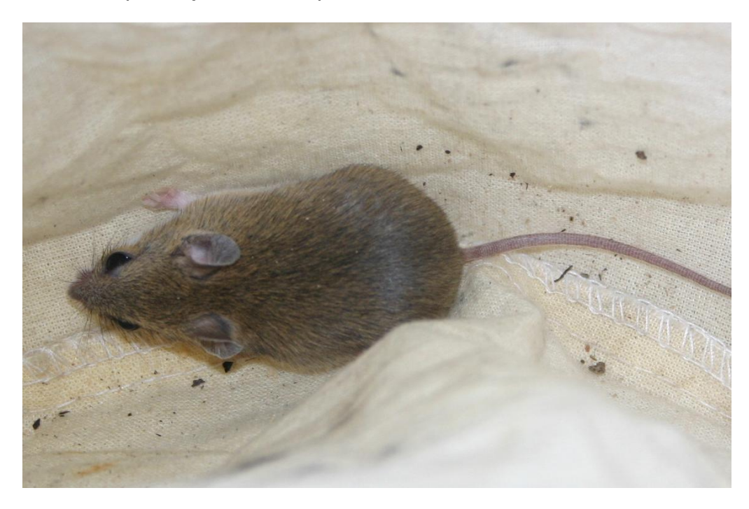
Figure 4: Delicate mouse caught in Elliot trap (viewed in calico bag)