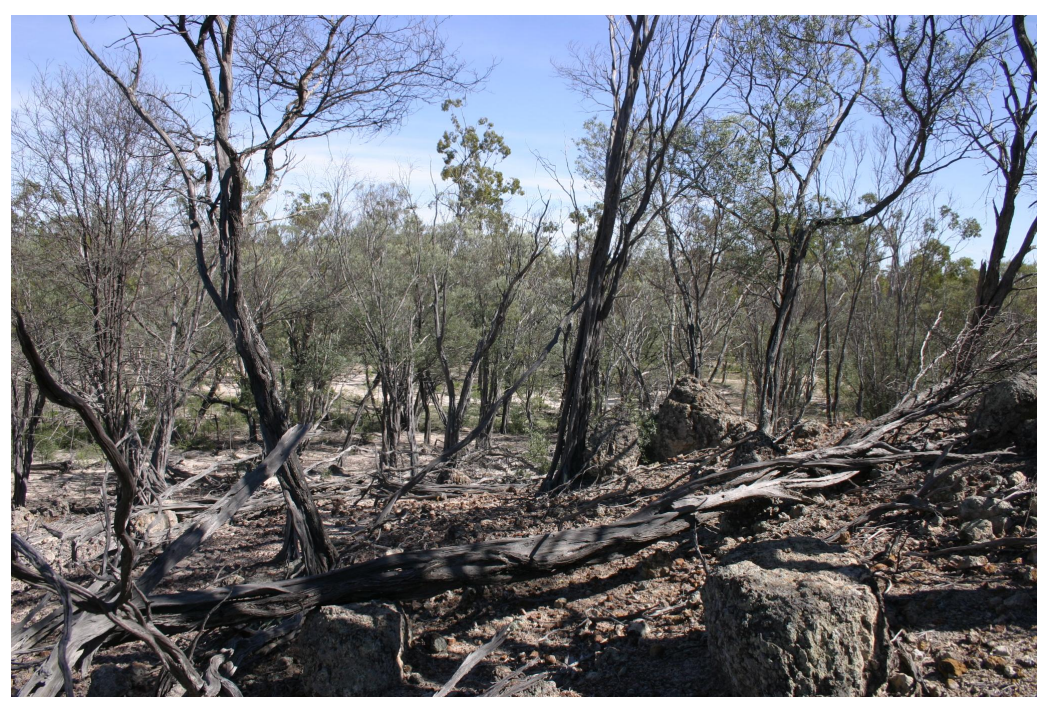
Figure 7: Rocky outcrops with Acacia stands

demonstrating the overlap in habitat use by the majority of bird species recorded within the study area.