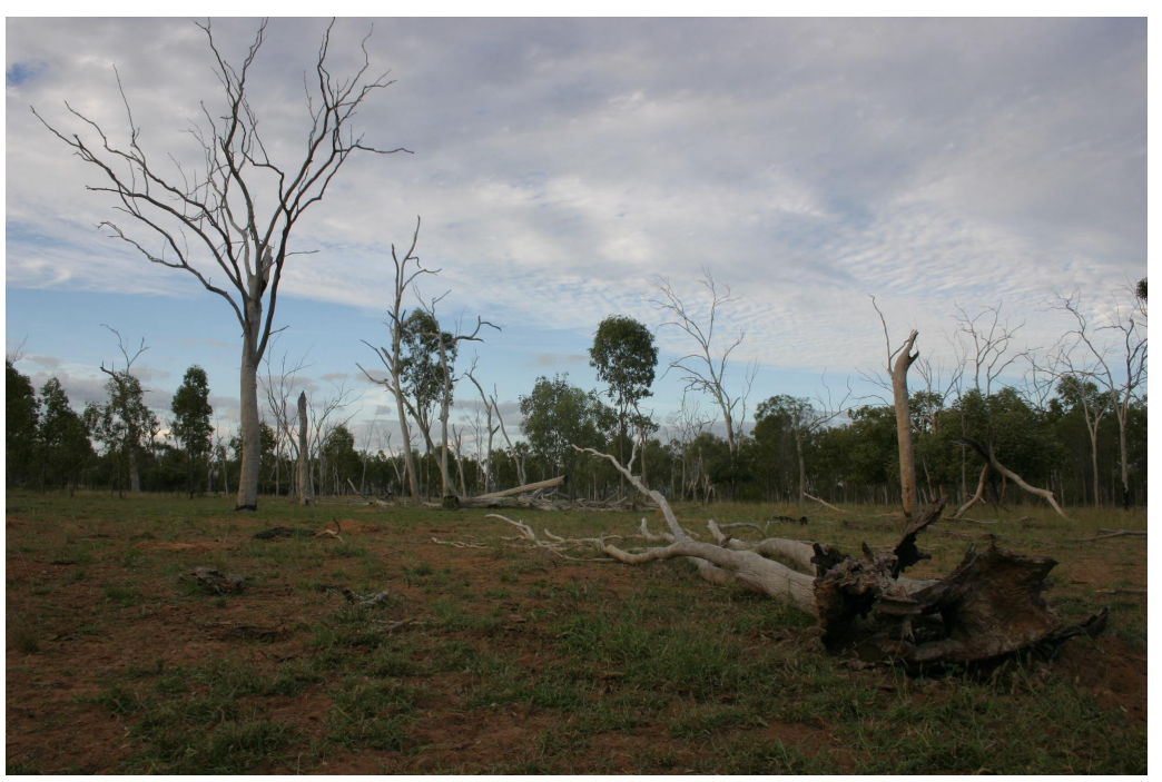
Figure 8: Semi-cleared areas of woodland

towards the western and southwestern boundaries of the study area, would be preferred areas to target for development.