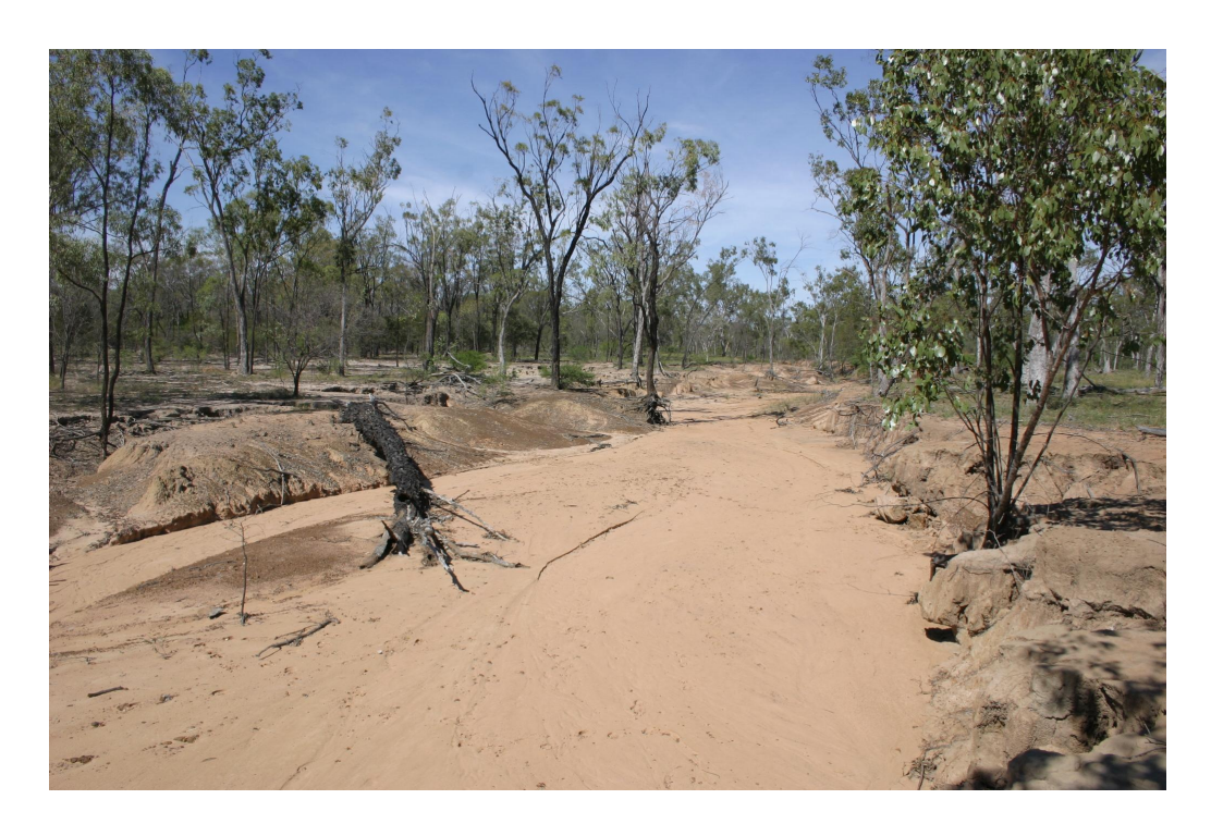
Figure 10: Ephemeral stream in the east of the lot