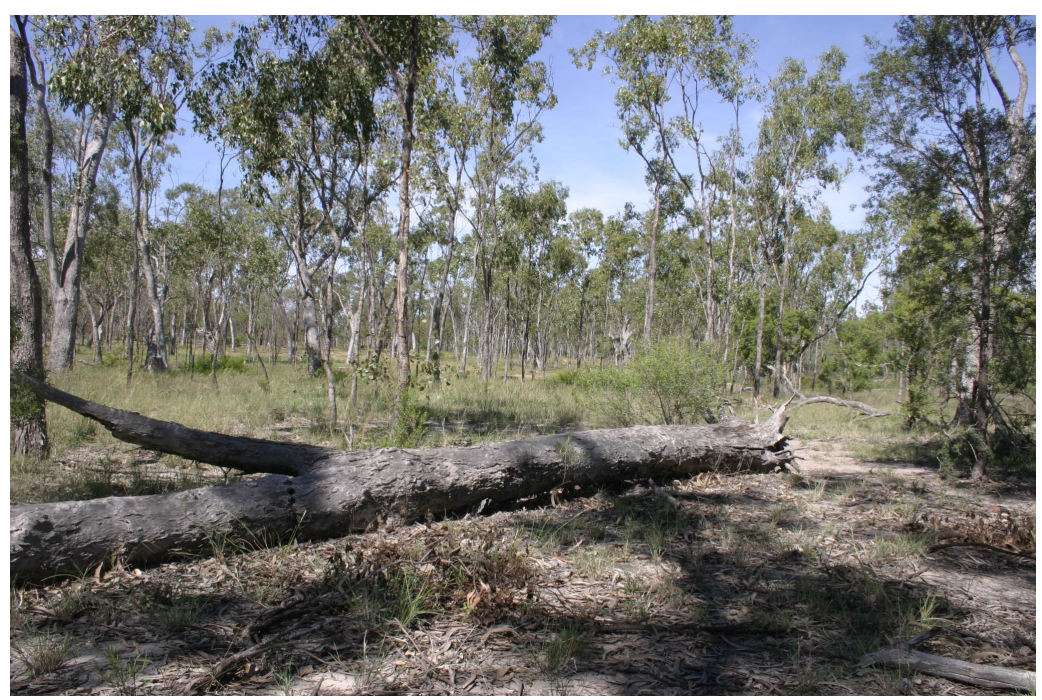
Figure 5: Open grassy woodland habitat

Open woodland comprises the majority of the habitat type within the study area. The tree layer of this woodland habitat is dominated by poplar box ( Eucalyptus populnea ), with a scattering of Clarkson's bloodwood ( Corymbia clarksoniana ) and small-leaved ironbark ( Eucalyptus crebra ) in some areas. This vegetation type corresponds with Not of Concern regional ecosystem (RE) 11.5.3 – see Figure 5.