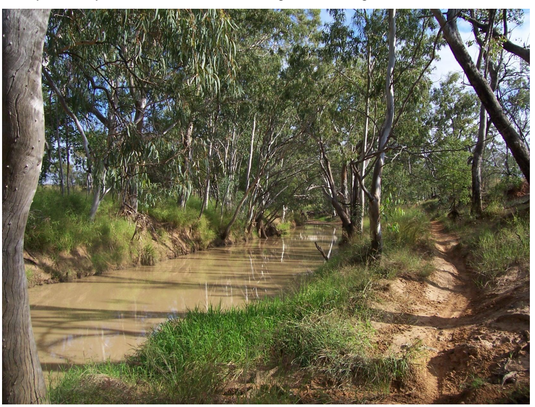
Figure 9: Grosvenor Creek

Species utilising Grosvenor Creek for breeding and foraging may occasionally visit or overfly the study site, en-route to other feeding and breeding areas.