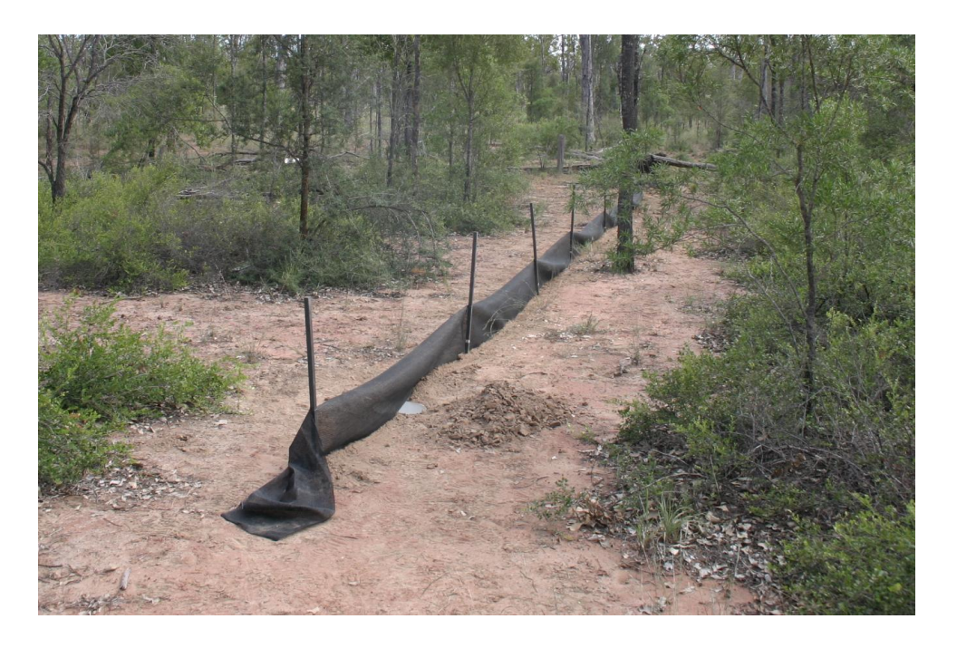
Figure 2: Pitfall trap line at transect one

One large cage trap was placed at each end of each transect in close proximity to potential fauna habitat and baited with the same substance as the Elliot traps. The traps were also sheltered with low vegetation or large pieces of bark.