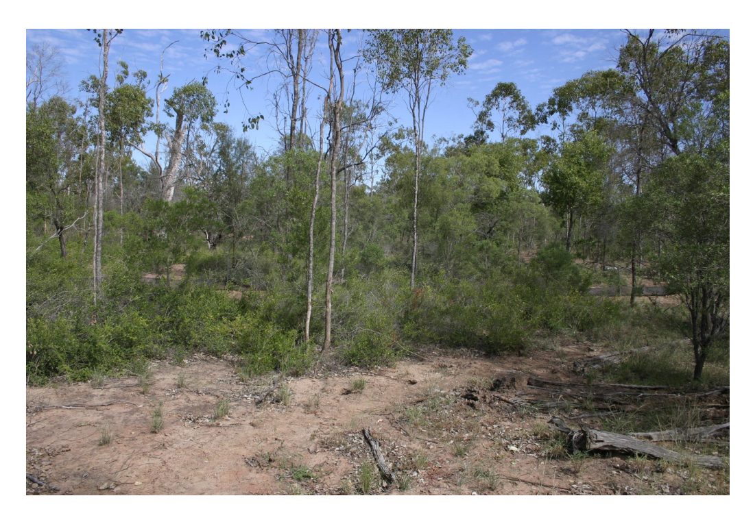
Figure 6: Shrubby woodland

This habitat type provided increased foraging and shelter sites for smaller woodland bird species such as the variegated fairy wren ( Malurus lamberti ) and double-barred finch ( Taeniopygia bichenovii ) in addition to many other woodland bird species. These birds were observed within the open woodland areas but may utilise denser habitats for refuge and roosting sites. The shrubby areas also appeared to be commonly utilised by grey-crowned babblers during their daily foraging activities.