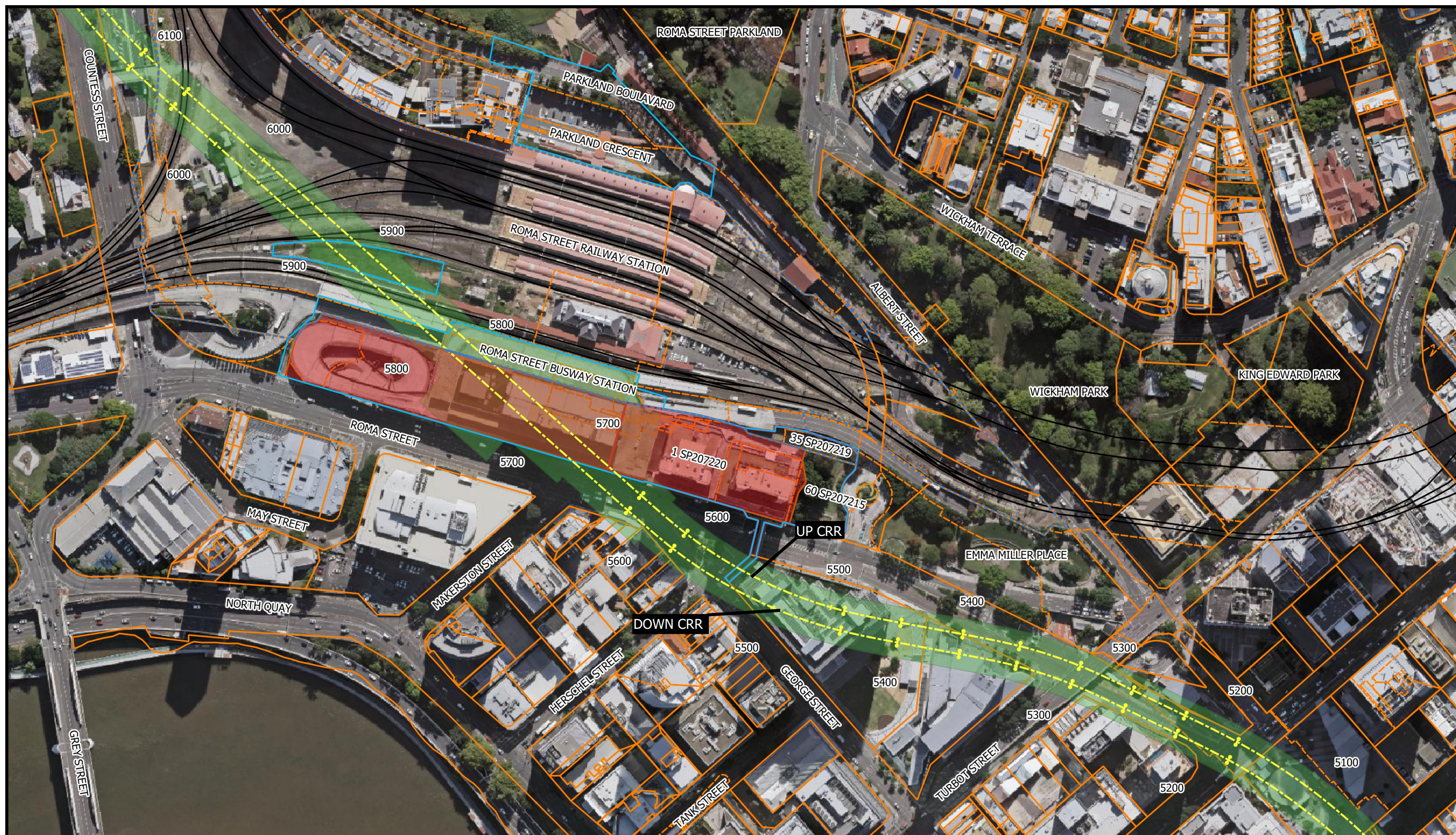
Figure 4: Changed Property Impact Plan