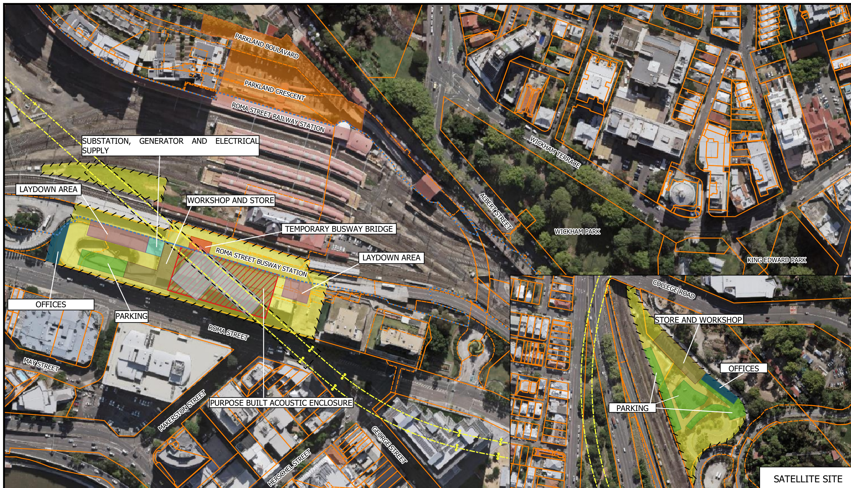
Figure 3: Approved Construction Site Plan