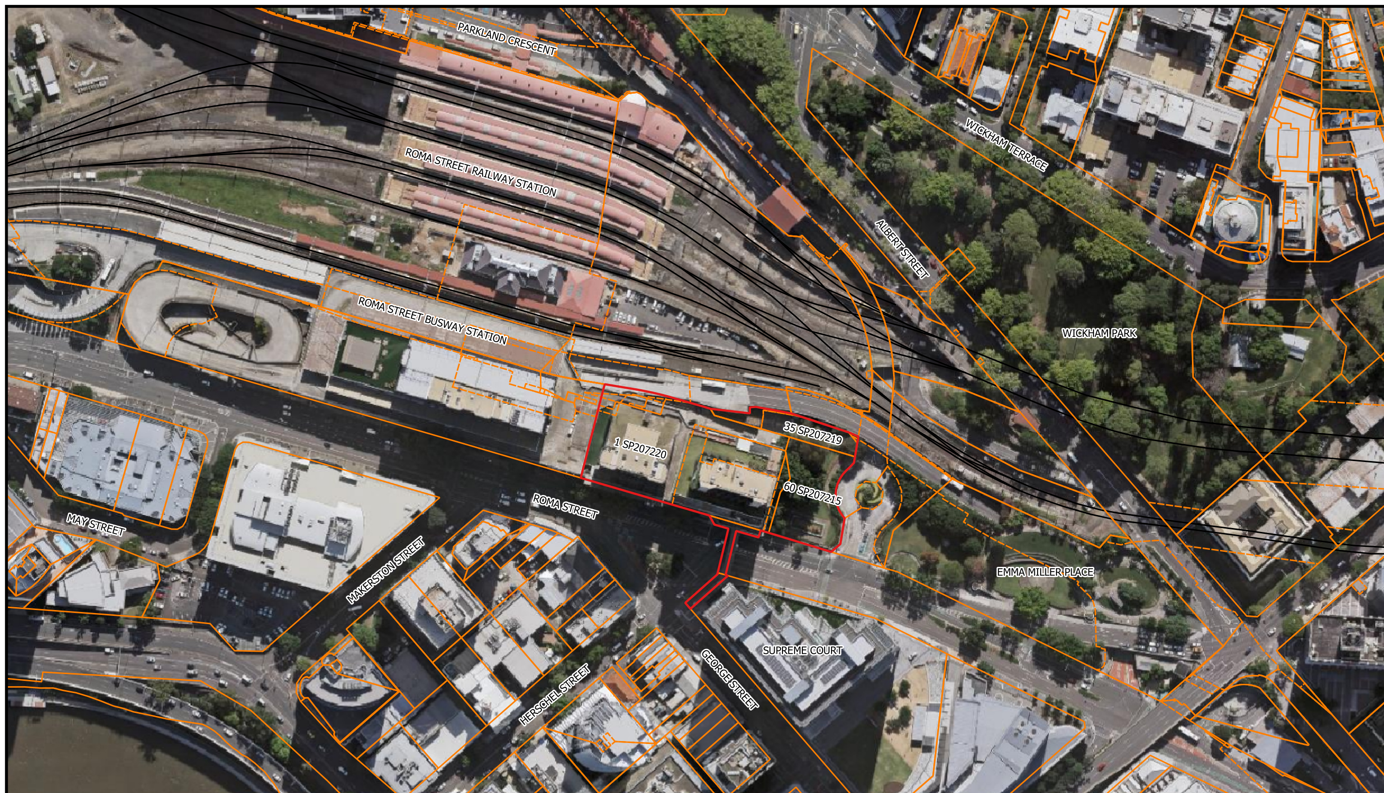
Figure 1: Roma Street Proposed Demolition Works