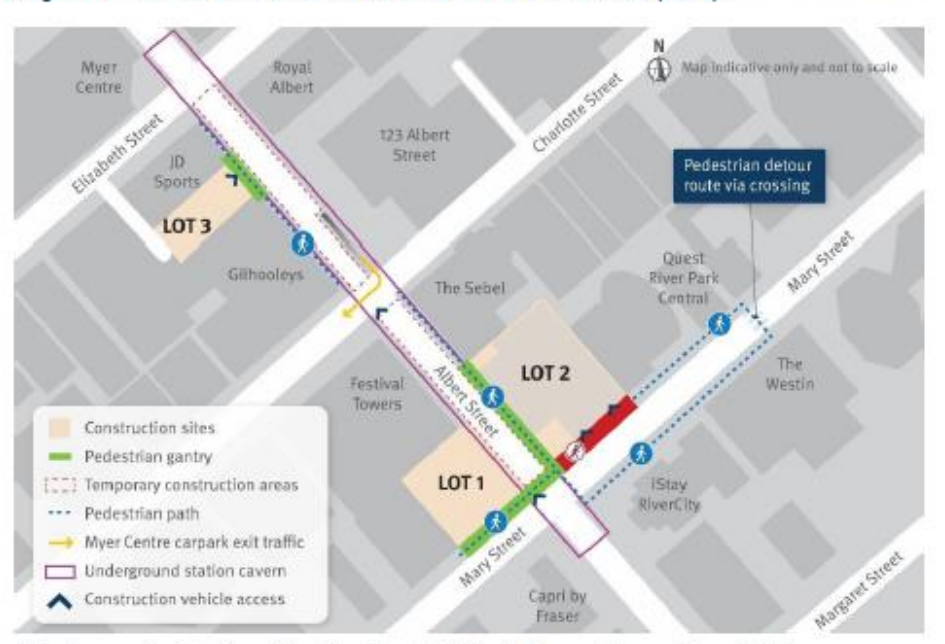
Map above: Indicative map showing the work locations throughout March. Turn over the page for work details.

Throughout March, works will continue at each of the three Albert Street station construction sites. This includes ongoing excavation for the future main station entrance (Lot 1), ongoing tunnelling activities within the acoustic shed to excavate the Albert Street underground station platform cavern (Lot 2) and ongoing bored piling and ground retention activities at the northern station entrance site (Lot 3).