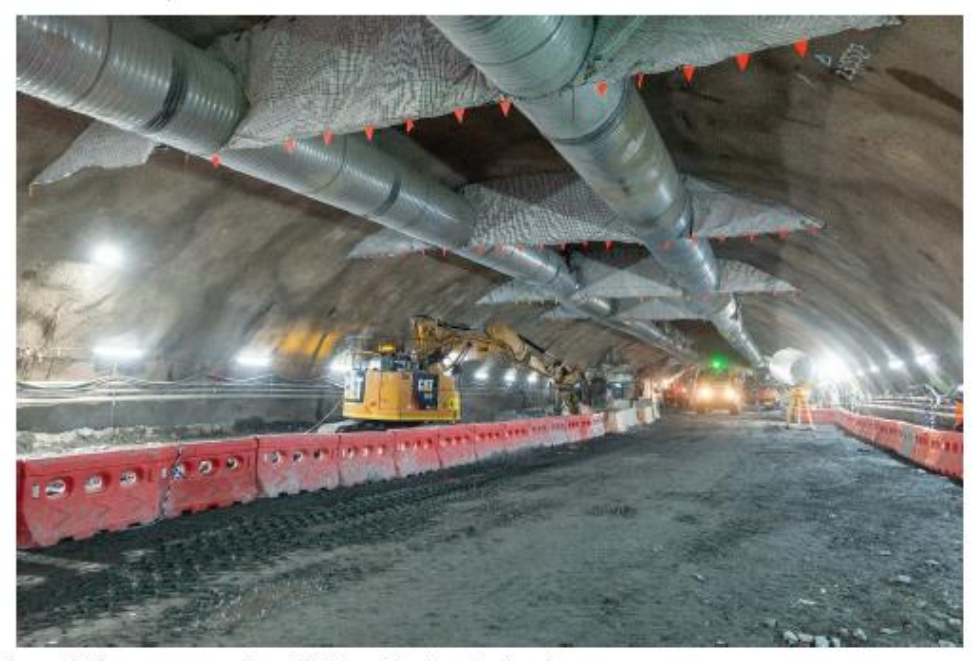
Image: Station cavern excavation at the Roma Street construction site

Station cavern excavation work continues underground with about 200 linear metres, just over 100,000 tonnes of material, now removed from site.