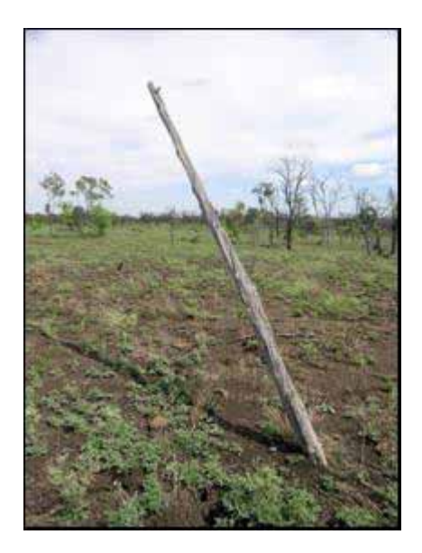
Figure 15.2 North View - Telegraph post

The telegraph line is located outside the projects area of disturbance and will not be impacted by the project.