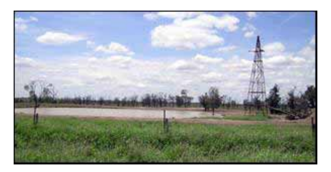
Figure 15.4 South-east view - Damaged windmill and one of two nearby dams.

The two dams and a water pumping windmill are located outside the project's area of disturbance and will not be impacted by the project.