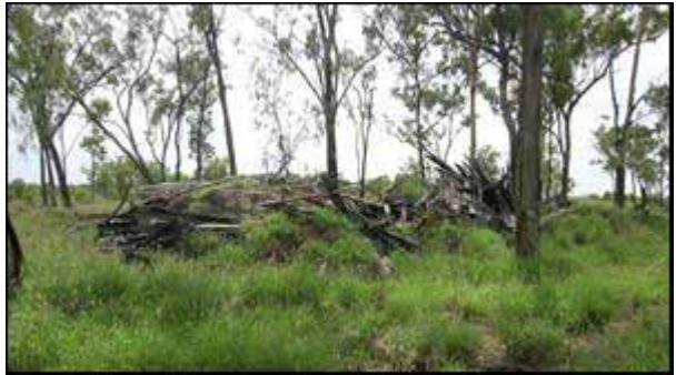
Figure 15.3 South east view - Piles of sawn timber.