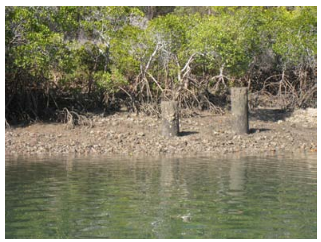
Plate 3 Jetty remnants on southern bank of Graham Creek.

Lines of old station fence posts were identified during a recent heritage survey on the western side of Curtis Island (Archaeo Cultural Heritage Services 2009). While these posts were noted, their full extent was not fully documented. As part of the present investigation, these derelict fence lines were followed and mapped. One line was found to extend south from the mangroves on the southern side of Graham Creek to enter the proposed LNG facility site from the north western boundary. This fence line continues 440m in a southeasterly direction to the shore of an extensive mud flat, then skirts the edge of this mud flat to the mangroves facing North Passage Island (Plates 1 and 4). Another fence line branches southward for 480m to a dam and abandoned concrete cattle trough. The fences have been used to keep cattle from straying onto the mud flats. A similar line of fence posts is found around a mud flat to the south of the project area. Scattered posts are also found elsewhere through the project area and will be fully mapped prior to construction.