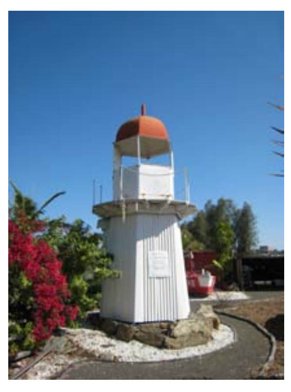
Plate 2 Sea Hill Point Lighthouse dating from 1960s, removed to the Gladstone Museum in 2009.

In addition to these locally significant sites, additional sites were discovered following discussions with local historian Mr. J.W. Harris. Mr. Harris is very familiar with the pastoral history of Curtis Island and is aware of several unlisted sites on Laird Point. These include a house site associated with the Price family, an underground, brick-lined water tank and a child's grave. These were not located during a field survey of Laird Point, but will be relocated prior to finalisation of the pipeline route. These sites are listed in Table 3.