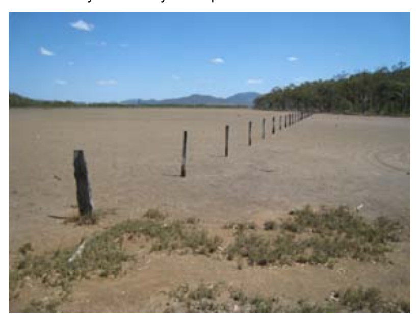
Plate 1 Remnant of fence line along the edge of mud flats in the Australia Pacific LNG facility site.

A small number of sites have been located during preliminary fieldwork conducted in the Australia Pacific LNG facility site study area (See Figure 1). These have been incorporated into the assessment. These provide an indication of non-Indigenous heritage sites that occur in the region to be affected by LNG facility development.