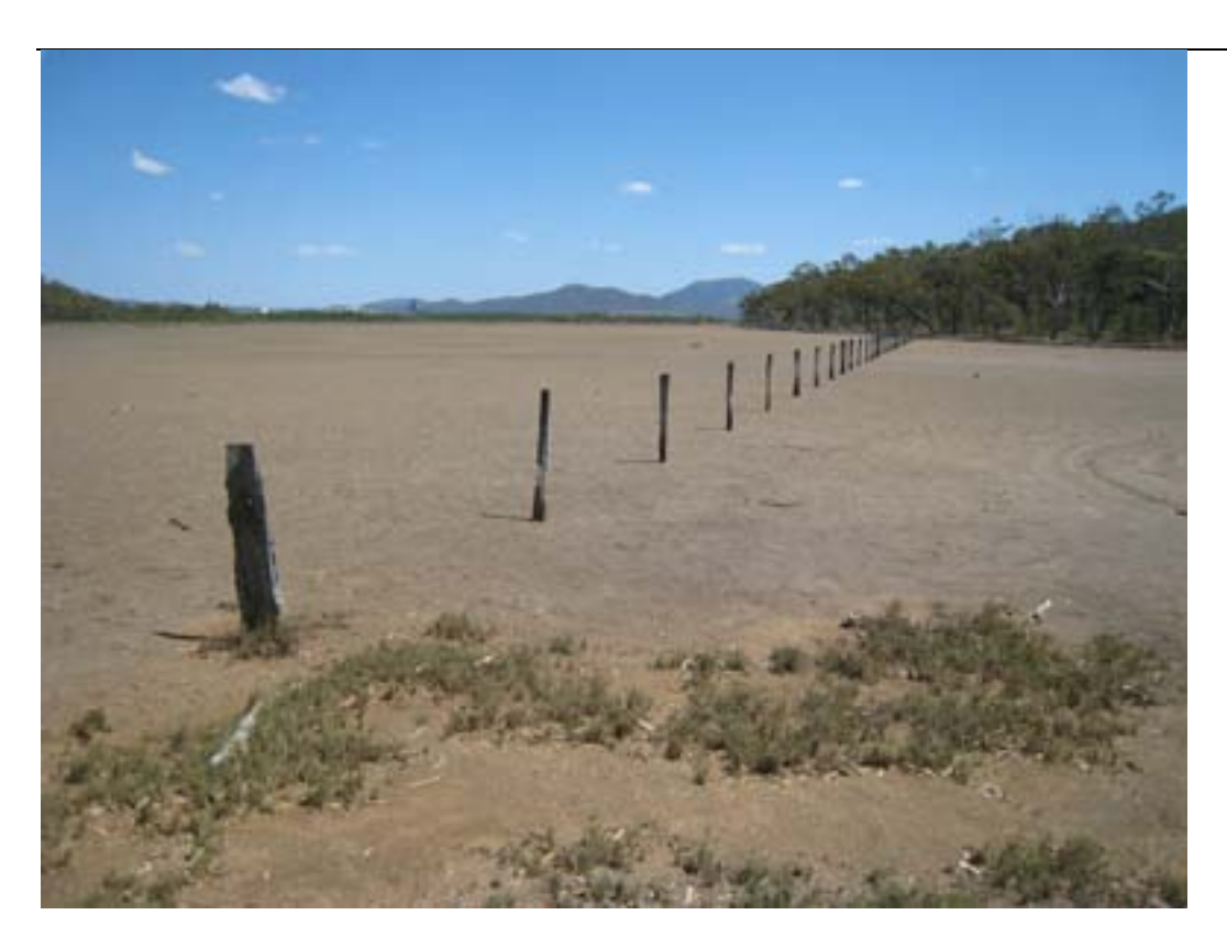
Plate 4 Pastoral fence line crossing mud flats in the Australia Pacific LNG Plant site. Mount Larcom is in the background.

The fence posts originally supported 3 strands of wire, and traces of rusted barbed wire remain in places. In other areas, more recent wire is present, and near the dam at the southern end of the fence line, and in the mangroves adjacent to Graham Creek are found fallen rails. The sites located during the field survey are listed in Table 5.