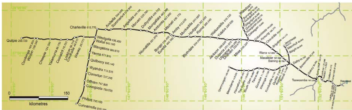
Figure 13.5 Western system rail network

A number of branch lines also connect to the Western System, including the Jandowae branch terminating at Jandowae, the Wandoan Branch terminating at Wandoan and the Glenmorgan branch terminating at Glenmorgan. The nearest railway station within the vicinity of the Project is Jandowae Station, located along the Jandowae branch, approximately 40 km west of the Project Site.